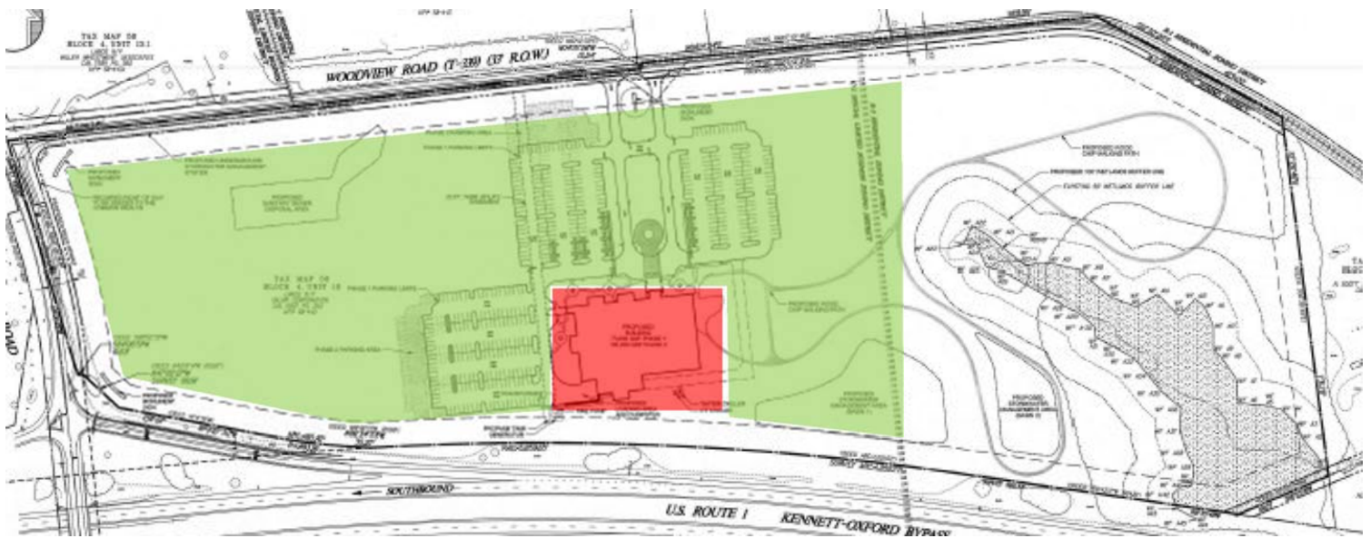
Figure 1: Potential locations of geothermal wells. Red is the building location. Green is the potential well locations.

The solution that will most likely provide the most energy savings for the Medical Office Building is the installation of a geothermal system on the site. Geothermal systems are desirable because of the constant and steady temperature of the earth. The earth provides a constant temperature of around 50 °F below 10 feet which provides a heat sink for heating and cooling. Heat is extracted from the earth in the winter and dumped into the earth in the summer. The Medical Office Building is located on a rather large site which would allow for plenty of space to locate a geothermal well field as can be seen in figure 1 where green represents the building location and red represents the potential well locations. The geothermal system would use either water or a modified refrigerant to circulate in the loop. Using a geothermal system would allow the building to no longer use propane gas as a fuel source in the roof top units and therefore save money.